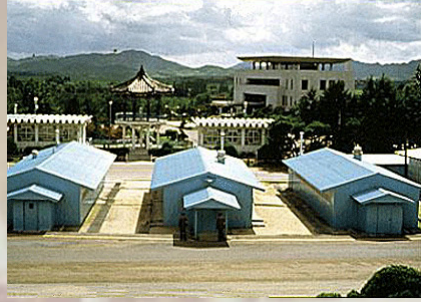
Figure: North Korea – South Korea Land Boundary